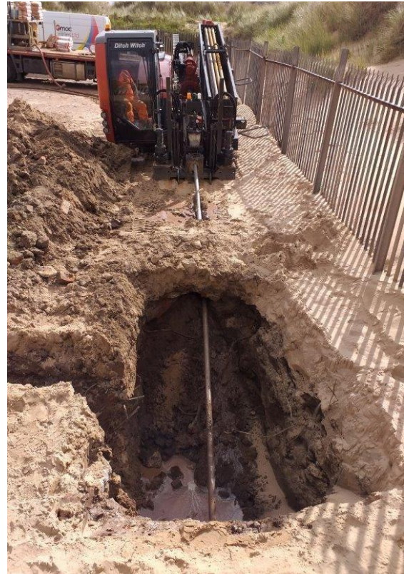
Drilling under the dunes commences