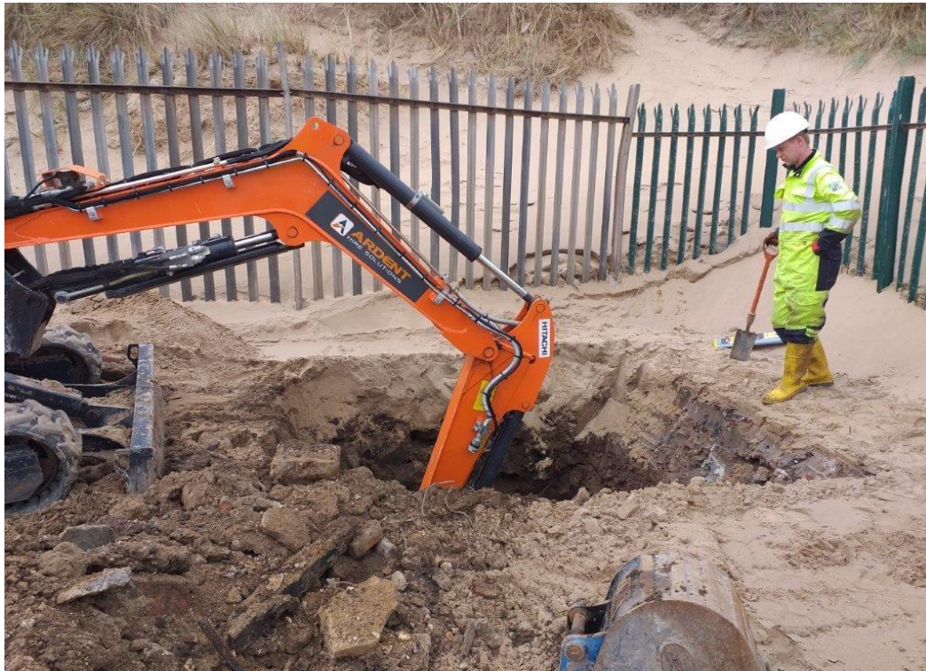
Chamber pit excavation