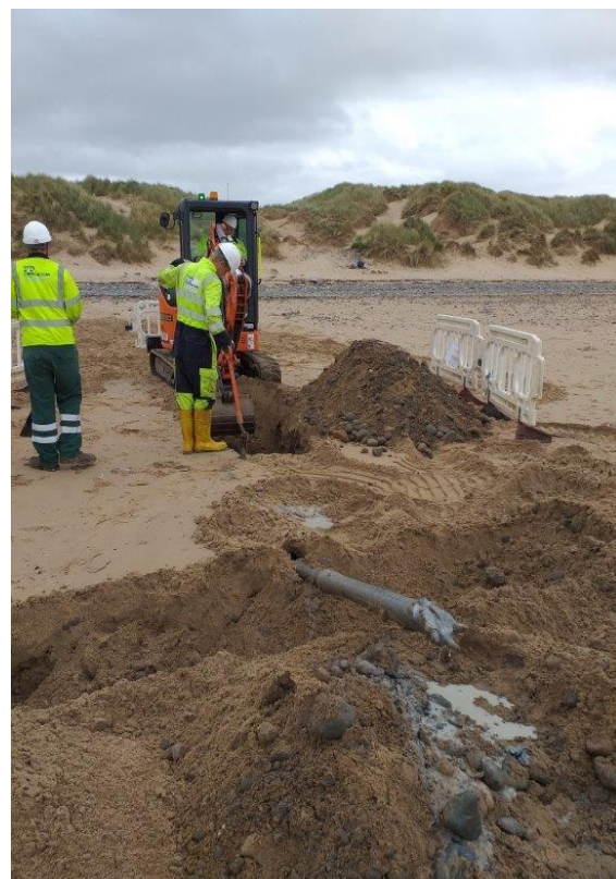
Duct punches out on beach