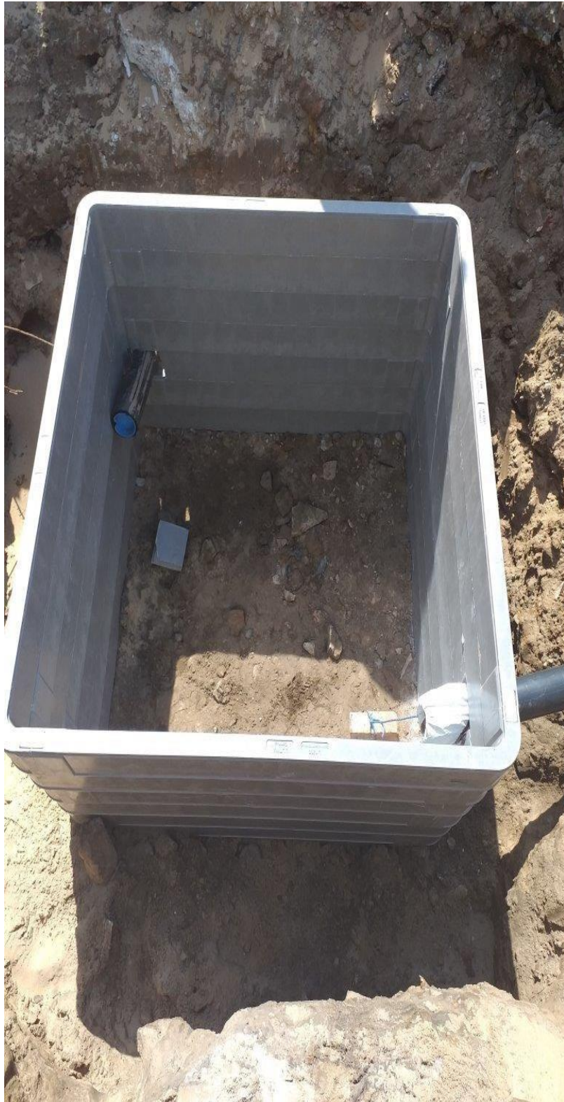
Connection chamber installed with duct-entry points