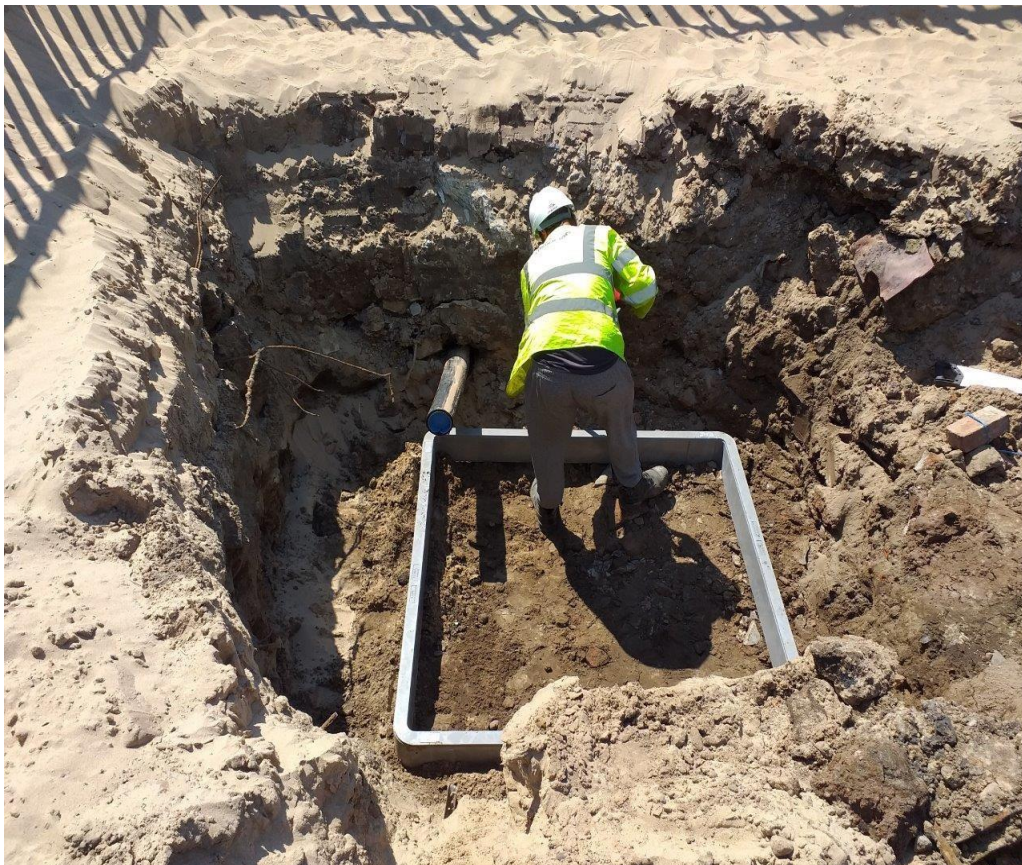
Duct connection chamber construction