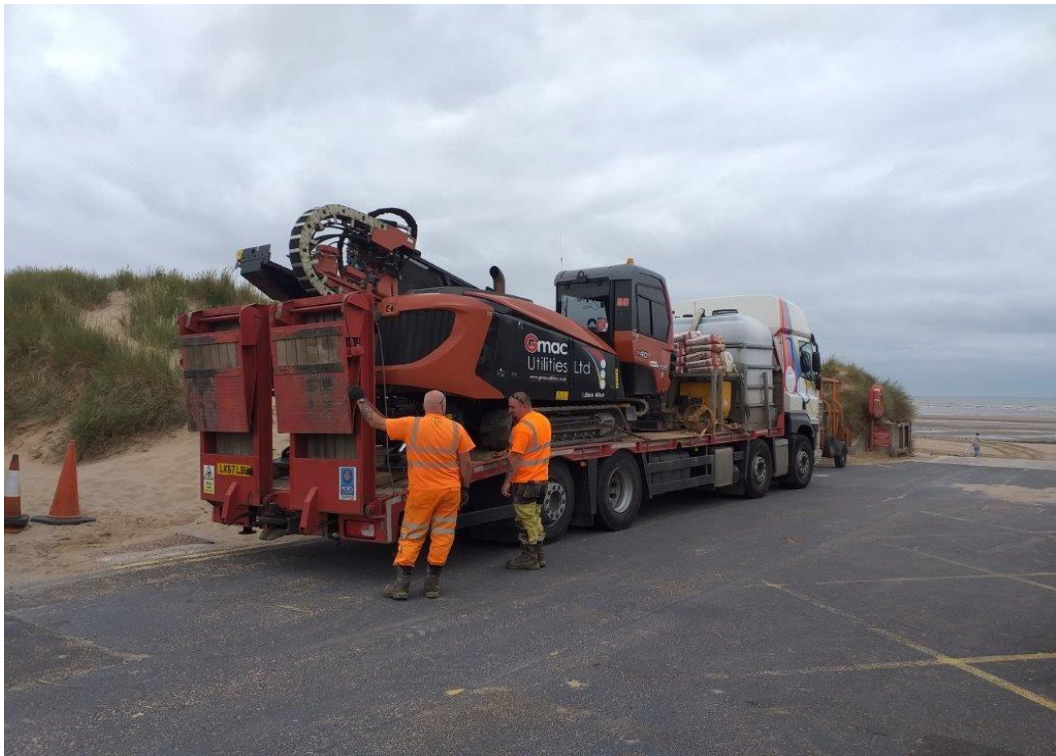
Ditch-Witch rig arrives on site