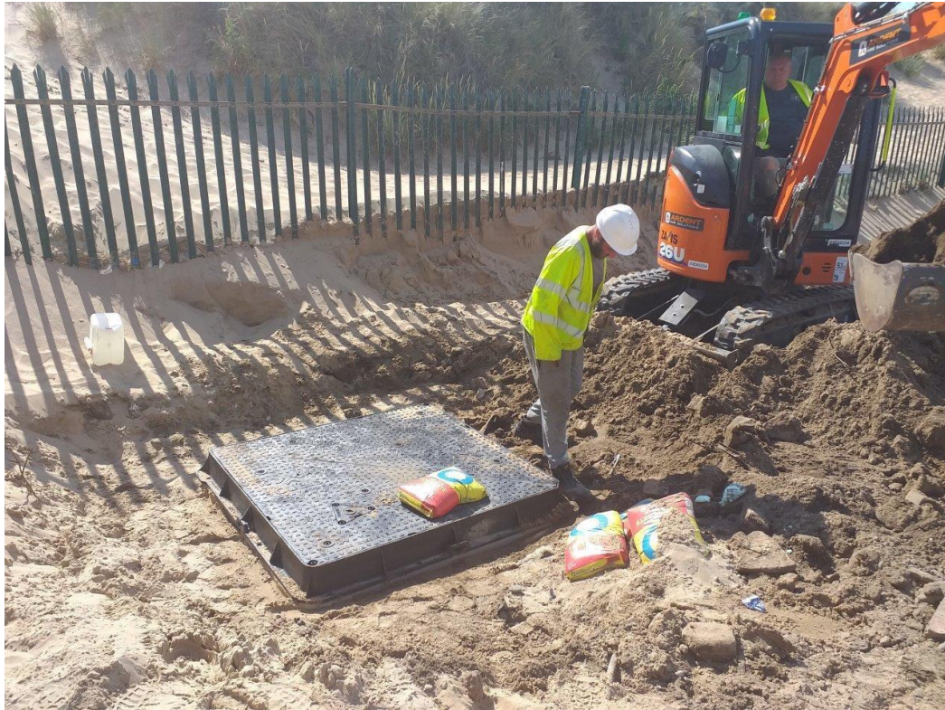
Duct man-hole cover installed