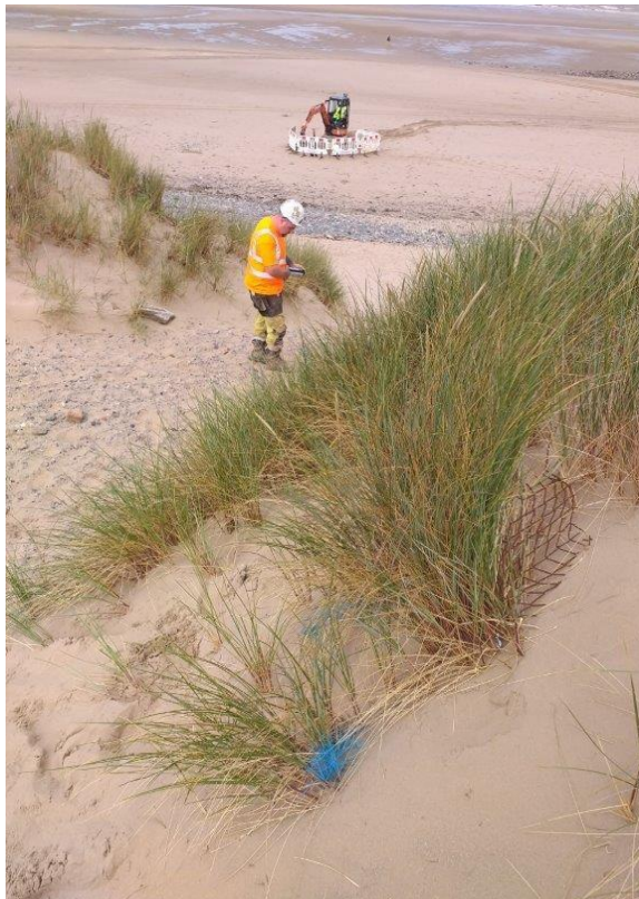
Marking of bore towards duct beach pit