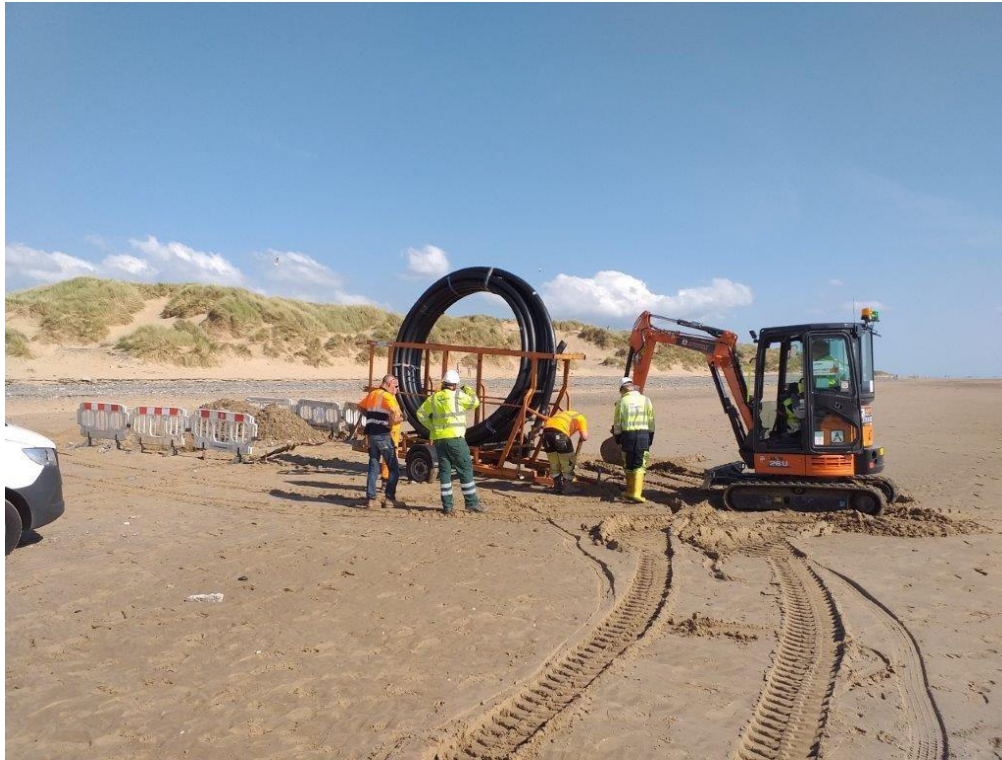
Duct pipe installation commences